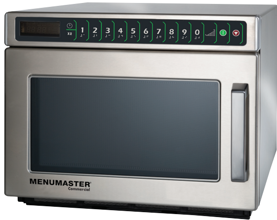
Model DEC18M shown