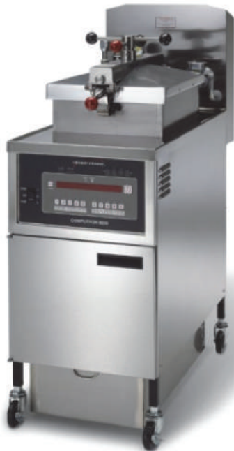
PFG 600 gas pressure fryer with Computron™ 8000 control

Henny Penny first introduced commercial pressure frying to the foodservice industry more than 50 years ago. Frying under pressure enables lower cooking temperatures for longer oil life, and faster cooking times to meet peak demand. Pressure also seals in food's natural juices and reduces the amount of oil absorbed into product.