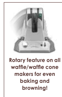
Rotary feature on all waffle/waffle cone makers for even baking and browning!